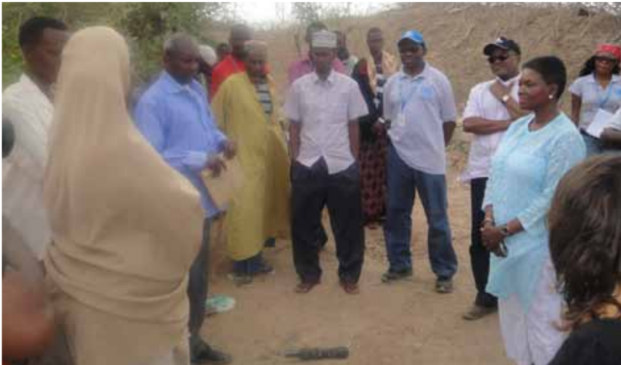
Under-Secretary-General for Humanitarian Affairs and Emergency Relief Coordinator Valerie Amos meets with host communities in Dadaab during her recent visit in August 2011

D rought conditions have led to rapid depletion of pasture and water for livestock, increased migration of livestock, and eroded food security, particularly among pastoralists in north and north-eastern Kenya. The food beneficiary population has increased from 2.4 million people to 3.75 million according to the Long Rains Assessment conducted in August 2011.