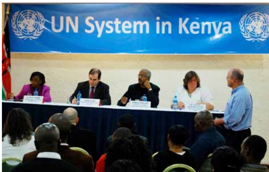
UNCG Press conference to mark World Humanitarian day 2011 at Hilton Hotel, Nairobi

Second Africa Governance and Leadership Convention held