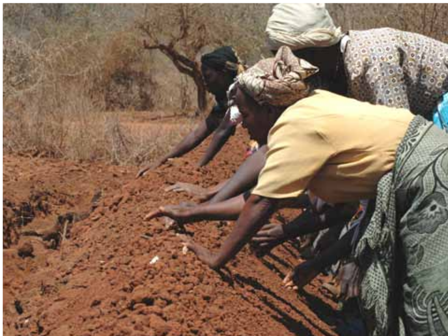
Farmers working through an FAO voucher-for-work project in eastern Kenya, terracing their land in preparation for the October rains.

Farmers, working through Farmer Field and Life School groups are terracing at least one acre of their land so that fertile topsoil is not swept