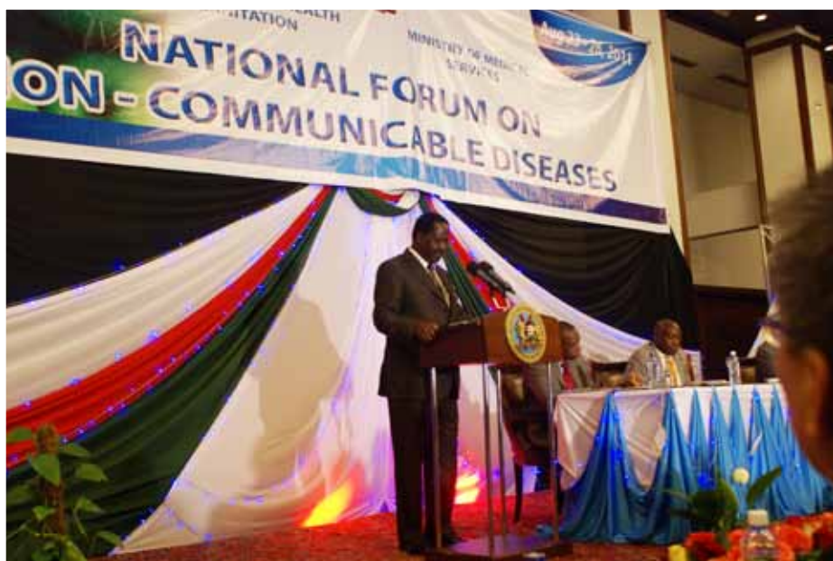
Honourable Prime Minister Raila Odinga giving the keynote remarks at the official opening of the Forum in Nairobi

The four days forum, organized by both Ministries of Health with support from partners, in particular