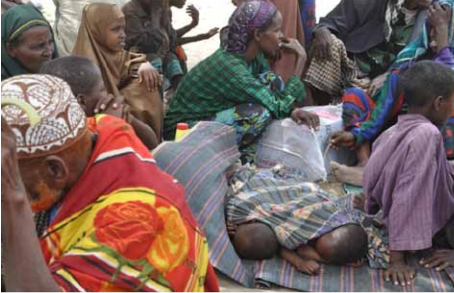
The prevailing drought and famine in north-eastern Kenya has driven communities from as far as Wajir to the outskirts of Dadaab. Asylum seekers from Somalia are also in desperate need of transportation and medical assistance

The International Organization for Migration (IOM) on 28 August 2011 started initiatives to assist indigenous communities in Dadaab to access basic needs in the aftermath of the drought that has hit the Horn of Africa.