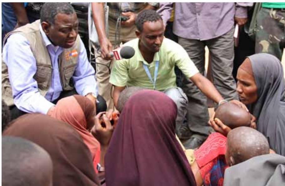
Dr. Osotimehin meets Somali refugees at the Hagadera refugee camp in Kenya

D r. Babatunde Osotimehin, Executive Director of the United Nations Population Fund (UNFPA), visited Dadaab refugee camps in Kenya recently to underscore the urgent needs of women affected by the famine in the Horn of Africa.