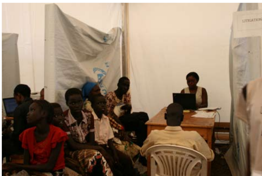
An Ethiopian refugee family goes through the verification process in Kakuma

Verification of refugees in Kakuma commenced on 22 November 2010 in an exercise that is jointly being conducted by UNHCR and the Government of Kenya through the Department for Refugee Affairs (DRA) and the National Registration Bureau (NRB). This is the first time UNHCR and the Government are simultaneously verifying refugee data since the camp was established in 1992. The exercise